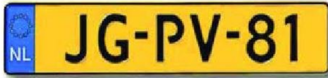
The European flag/Marian symbol appears on every license plate in the EU

Dr. Habsburg wants to see Europe have an elected head of state — a man elected for life. This influence of both Charlemagne and the Habsburgs hangs4