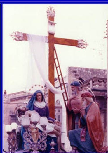
Original Photo Malta 1984