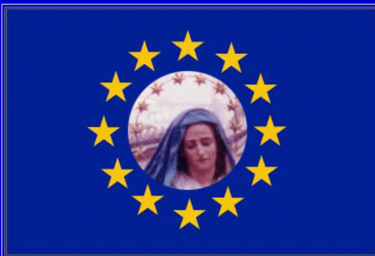
Photo of Mary with 12 star crown set within EU circle of stars. The blue of her mantle matches that of the flag.

In spite of the evidence, some would still argue that the Marian symbolism is merely a co-incidence and that the EU flag was chosen as a non-sectarian, neutral symbol that all the peoples of Europe can identify with and accept. Any suggestion otherwise is relegated to the realms of fallacious conspiracy theories. But, can this be dismissed so lightly?